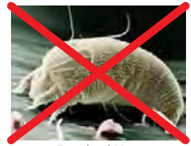
Eriophyid Mite Microscopic - too tiny to see

Your neighbor-volunteers have cut-back and sprayed all of the infected Texas Rangers in the common areas. Weekly spraying will continue for a total of 3 applications.